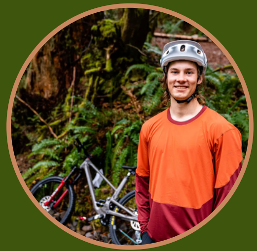
RHYS VERNER, WORLD CUP ENDURO ATHLETE